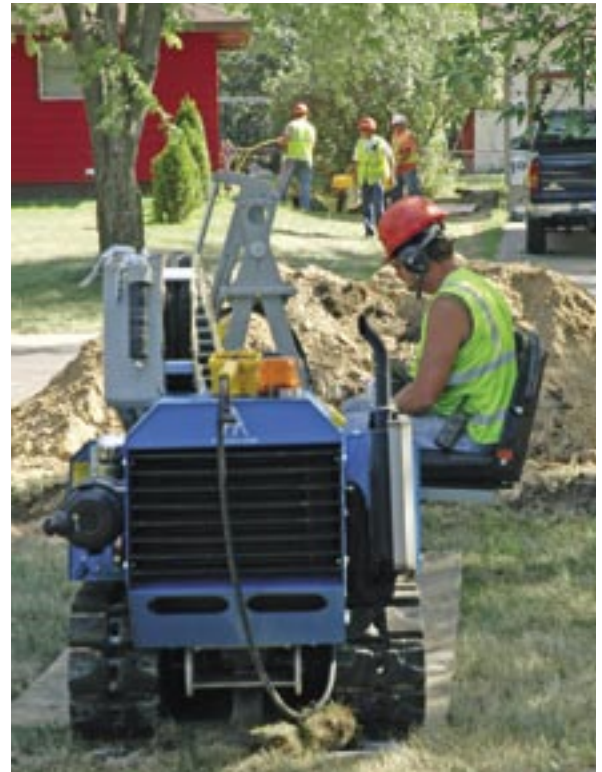
The compact 4X provides maximum drilling power in tight working conditions.