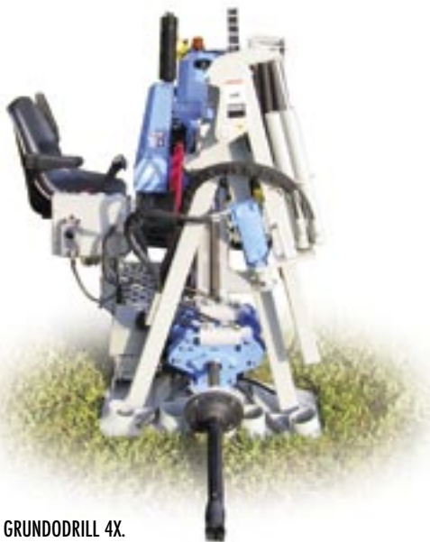
37.5 total HP GRUNDODRILL 4X.

Specifications subject to change at any time.